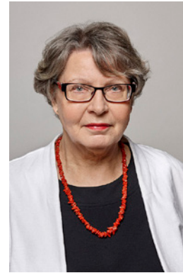
Personnel representatives At meetings of the Board of Directors, personnel representatives have the right to attend and to speak. They are not members of the Board of Directors.